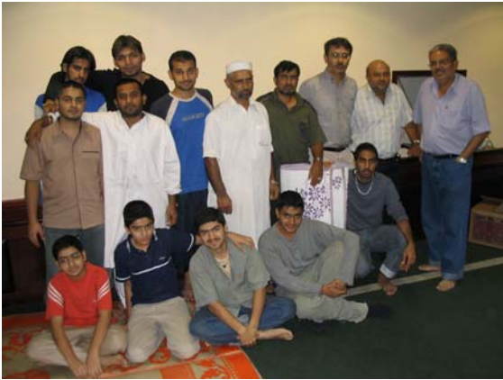
A youthful looking committee of volunteers go unnoticed during Iftar time at Satwa Imambargah during Ramadhan. SYD thanks this tireless team for their efforts round the year